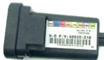
OEM 68920-01D 68922-00D