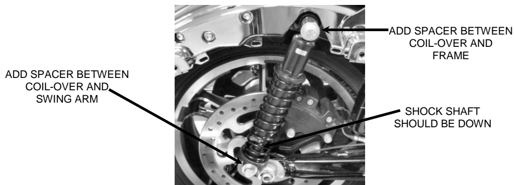
FIGURE 1 ONLY FOR MODELS EQUIPPED WITH COIL-OVER SHOCKS

* Cobra® recommends you always wear a helmet while riding. Please never operate your motorcycle while under the influence of alcohol and/or drugs. Enjoy the new look of your motorcycle and please ride safely.