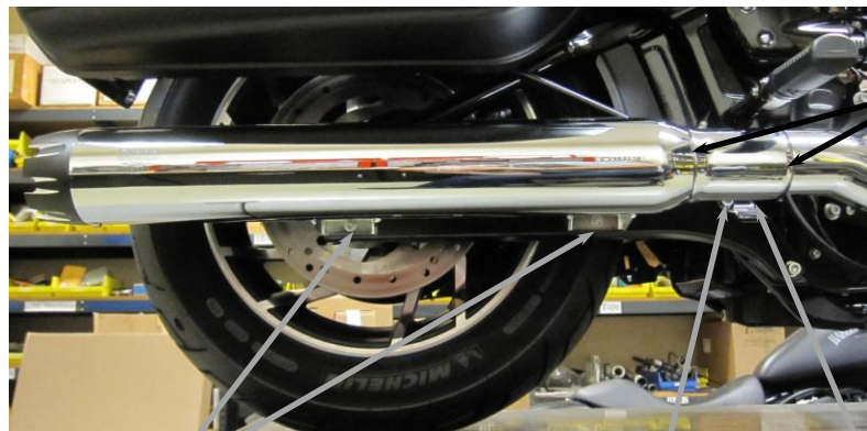
STOCK MOUNTING BOLTS