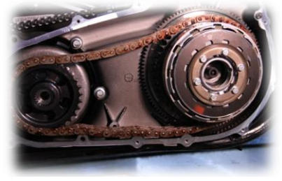
4) Install new 30 Tooth sprocket chain and basket. Figure 5