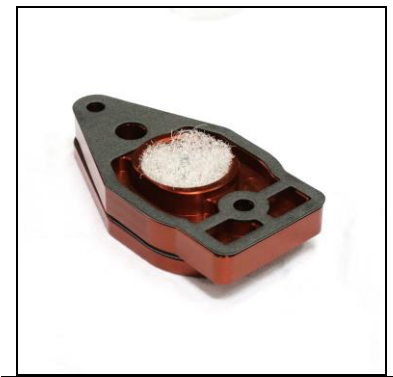
Install filter element and gaskets