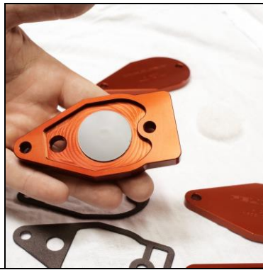
Install umbrella flapper valve