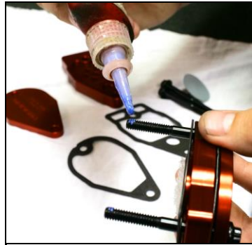
Apply Loctite to new ARP hardware