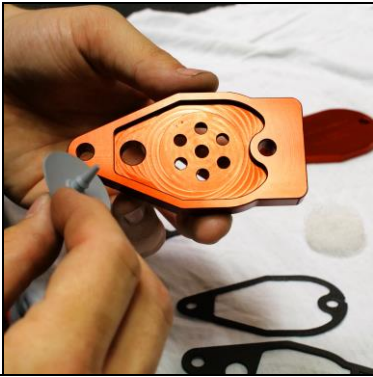
Install umbrella flapper valve