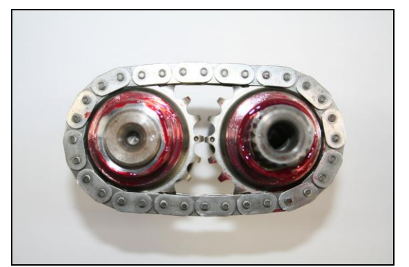
'07-'16 + conversion camshafts, inner cam chain #8060 installed with camshaft timing marks aligned. Lead with rear cam when installing into camplate