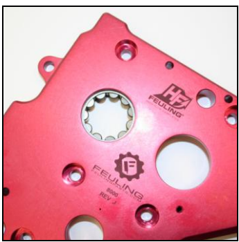
Set camplate into proper fixture to press roller bearing into camplate, verify bearing is pressed square and flush with camplate