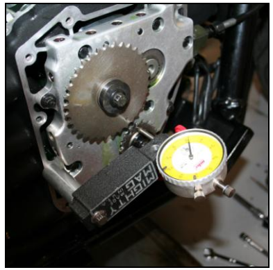
Engines that have extreme cam chain pad wear, inspect crank sprocket for side to side runout. The registry may need to be modified to help extend pad wear