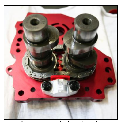
Inner cam chain + tensioners installed into '07-'16 camplate