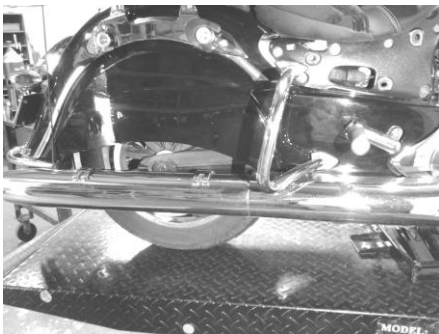
Figure 1.1 remove side covers and saddle bags

FREEDOM PERFORMANCE DOES NOT WARRANTY ANY CHROME OR CERAMIC BLACK PRODUCTS AGAINST DISCOLORATION.