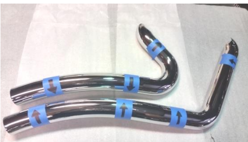
Figure 2.10 mark center and direction