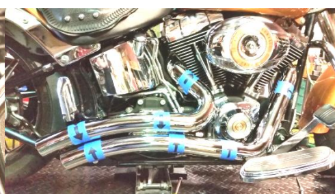
Figure 2.14 install rear heat shield and secure it with hose clamps