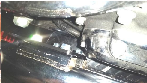
Figure 2.8 front of brackets align flush