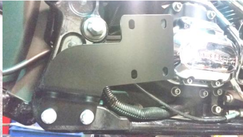
Figure 2.5 install mounting bracket