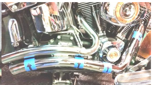
Figure 2.12 install front heat shield first and secure it with hose clamps.