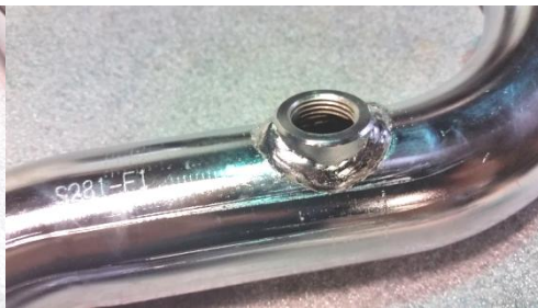
Figure 2.2 install adapter and plug