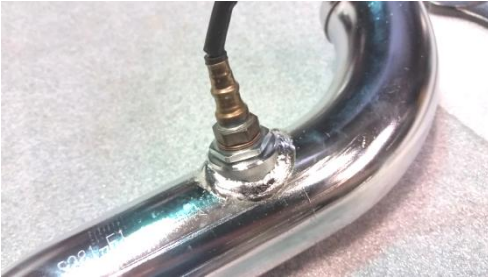
Fig 2.4 install adapter then 12mm sensor