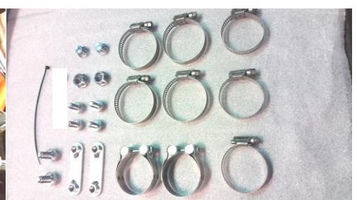
Figure 2.15 hardware

Note: use good and safe practices when removing and installing your new exhaust system to prevent injuries that includes but is not limited to such safety glasses and gloves. When installing make sure gloves are not abrasive or damage may occur like scratching parts. Always secure motorcycle before any work is done.