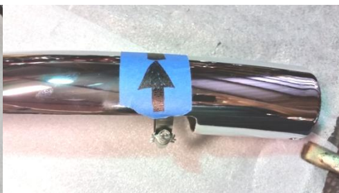
Figure 2.11 install hose clamps only one on each heat shield at the end (#28)