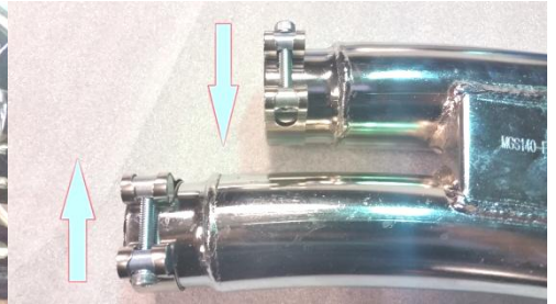
Figure 2.6 install barrel band clamps