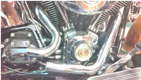
Figure 2.7 install headers