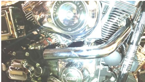
Fig. 2.7 Install front header pipe using stock flange nuts and 1/2" socket