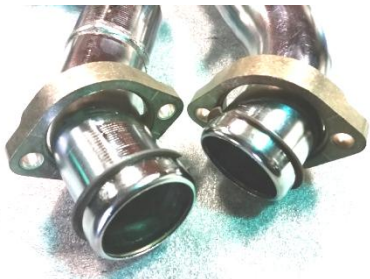
Fig. 2.1 Install both flanges and retaining rings