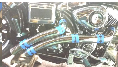
Fig. 2.14 Install rear heat shield