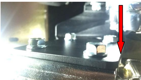
Fig.2.10 Muffer brackets are flush with mounting bracket