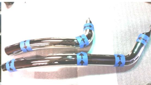
Fig. 2.11 Arrows indicate direction of hose clamp insertion