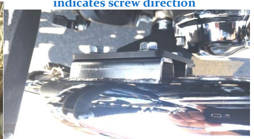
Fig.2.9 Install muffer as shown brackets must be flush use a 1/2" wrench