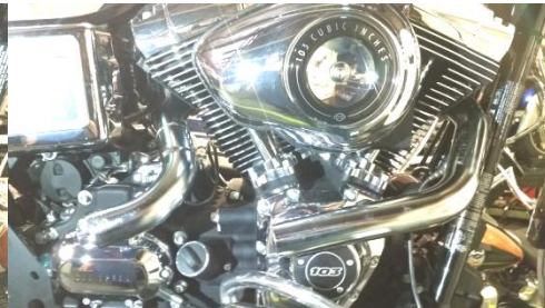
Fig.2.8 Install rear header using stock flange nuts and 1/2" socket