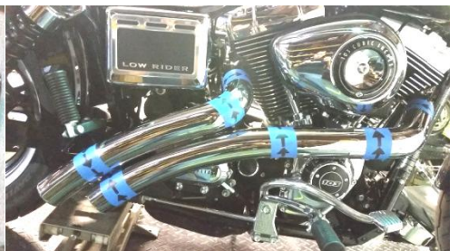
Fig. 2.12 Install front shield as shown