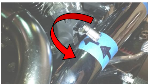
Fig. 2.13 Hose clamp insertion sample