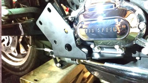
Fig. 2.5 Install mounting bracket as shown