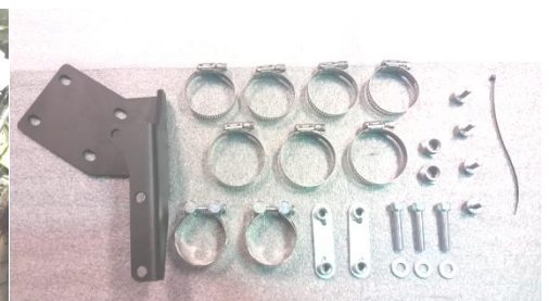
Fig. 2.15 Hardware and bracket

Note: use good and safe practices when removing and installing your new exhaust system to prevent injuries that includes but is not limited to such safety glasses and gloves. When installing make sure gloves are not abrasive or damage may occur like scratching parts. Always secure motorcycle before any work is done.