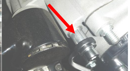
Fig. 2.6 Some models require spacer as shown.