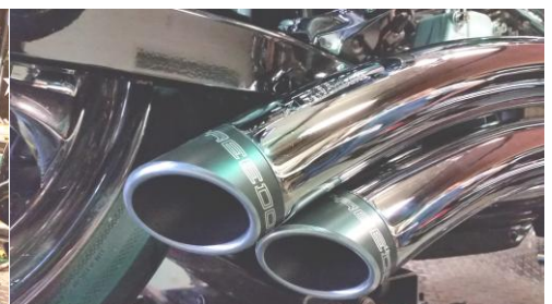
Fig. 2.15 Install end caps rotation is your choice.

Note: use good and safe practices when removing and installing your new exhaust system to prevent injuries that includes but is not limited to such safety glasses and gloves. When installing make sure gloves are not abrasive or damage may occur like scratching parts. Always secure motorcycle before any work is done.