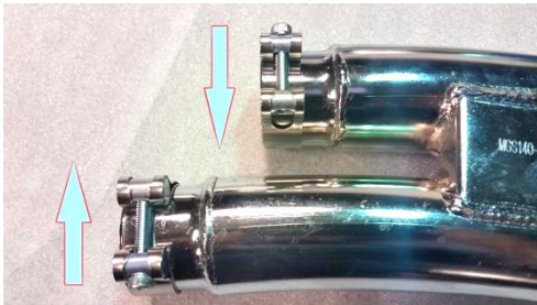
Fig. 2.7 Insert barrel band clamps over the muffer inlets as shown