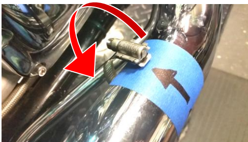
Fig. 2.13 Hose clamp insertion sample