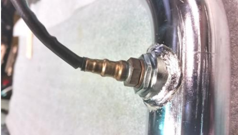
Fig. 2.4 Install 12mm sensor fist install adapter from M18 to M12