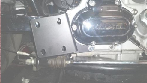
Fig. 2.5 Install mounting bracket as shown