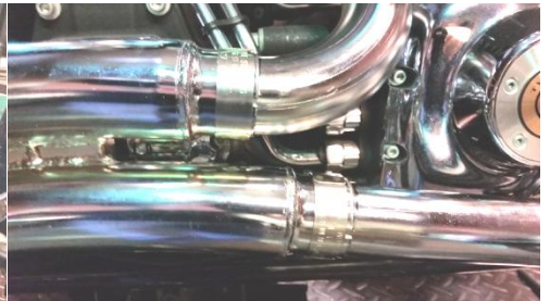
Fig.2.9 Install muffer as shown