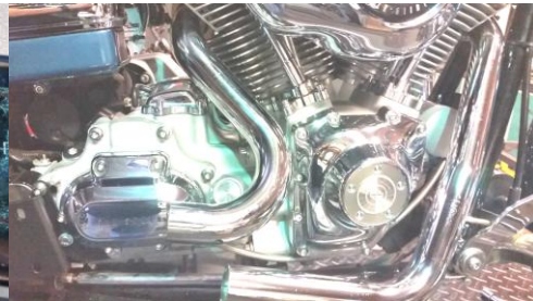
Fig.2.8 Install front and rear headers using stock flange nuts