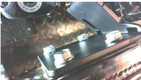
Fig.2.10 Muffer brackets are flush with mounting bracket (rear section)