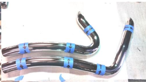
Fig. 2.11 Arrows indicate direction of hose clamp insertion