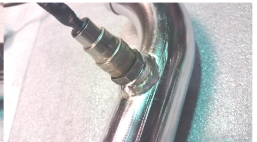
Fig. 2.3 Install M18 sensors use a 7/8" or M22 wrench