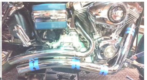
Fig. 2.12 Install front shield as shown