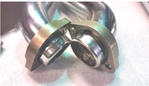
Fig. 2.1 Install both flanges and retaining rings