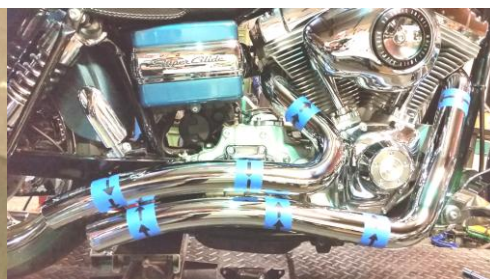
Fig. 2.14 Install rear heat shield