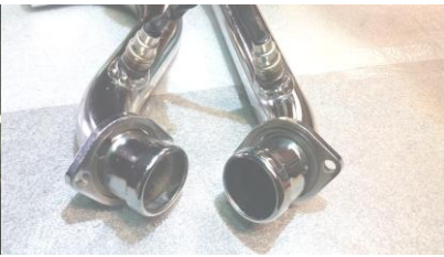
Figure 2.4 Install retaining rings and flanges.