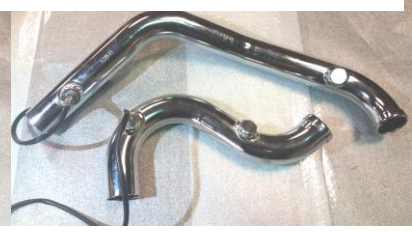
Figure 2.7 (10-up) Install 12mm sensors and 18mm plugs.