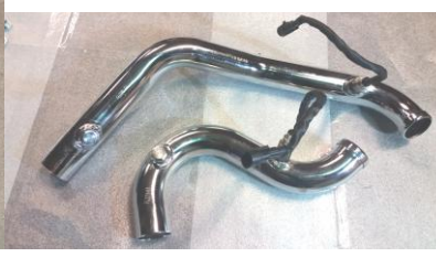
Figure 2.6 (07-09) Install 18mm sensors and 12mm plugs.