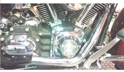
Figure 2.8 Install front header using stock flange nuts.