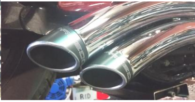
Figure 2.20 Install end caps use some type of locking glue.