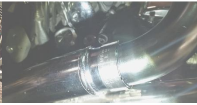
Figure 2.18 make sure barrel clamps are flush with the front of slotted inlets for a tight seal.