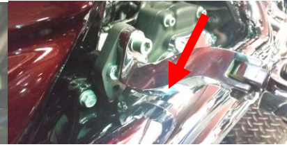
Figure 2.19 Install back passengers