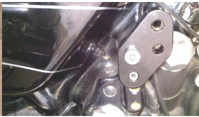
Figure 2.2 Install peg raiser as shown.