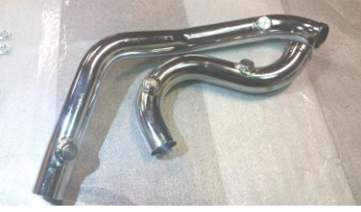
Figure 2.5 (95-06) plug all sensor bungs.