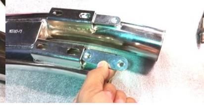
Figure 2.11 Insert back plate brackets as shown.