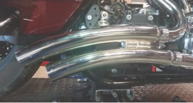
Figure 2.13 Align headers with muffler as shown.