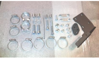
Figure 2.1 Hardware and brackets.