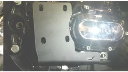
Figure 2.3 Install mounting bracket as shown.