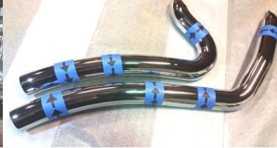
Figure 2.14 Mark arrows and center of welded clips as shown.