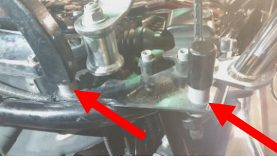
Models (95-08) use bigger screws and spacers as shown