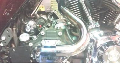
Figure 2.9 Install rear headers and align it with front header.