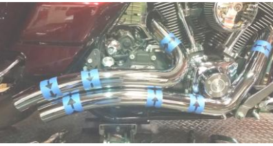
Figure 2.17 install rear heat shield.