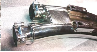
Figure 2.10 Install barrel band clamps as shown.