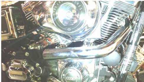
Fig. 2.7 Install front header pipe using stock flange nuts and 1/2" socket