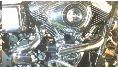
Fig.2.8 Install rear header using stock flange nuts and 1/2" socket