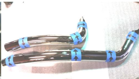
Fig. 2.11 Arrows indicate direction of hose clamp insertion