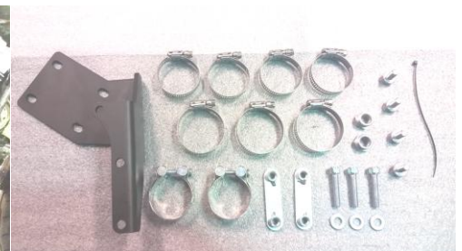
Fig. 2.15 Hardware and bracket

Note: use good and safe practices when removing and installing your new exhaust system to prevent injuries that includes but is not limited to such safety glasses and gloves. When installing make sure gloves are not abrasive or damage may occur like scratching parts. Always secure motorcycle before any work is done.