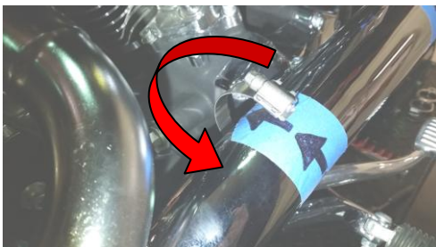
Fig. 2.13 Hose clamp insertion sample