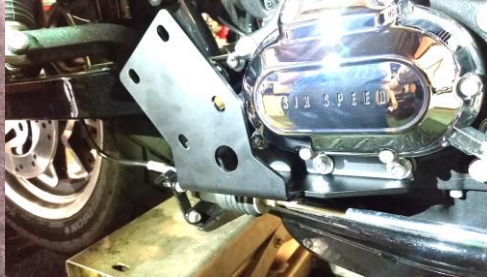
Fig. 2.5 Install mounting bracket as shown