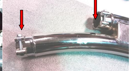
Fig. 2.6 Insert barrel band clamps over the muffer inlets as shown arrow indicates screw direction