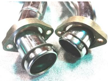
Fig. 2.1 Install both flanges and retaining rings