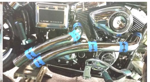
Fig. 2.12 Install front shield as shown