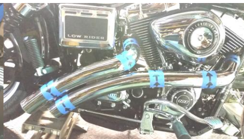
Fig. 2.14 Install rear heat shield