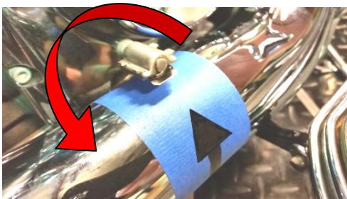
Figure 2.13 arrow indicates direction of insertion. Refer to figure 2.10