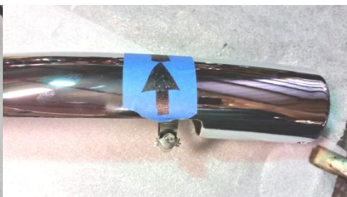
Figure 2.11 install hose clamps only one on each heat shield at the end (#28)