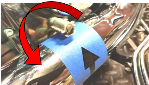
Figure 2.13 arrow indicates direction of insertion. Refer to figure 2.10