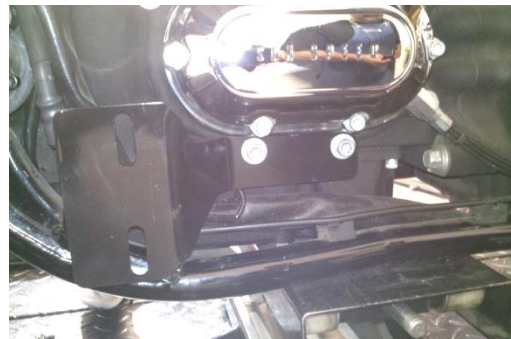
Figure 2.1 without spacers