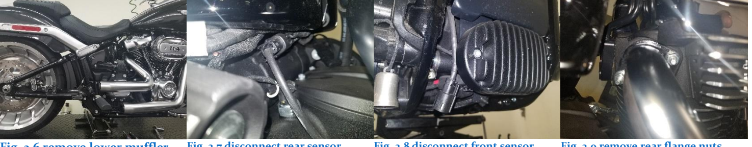
Fig. 2.6 remove lower muffler Fig. 2.7 disconnect rear sensor