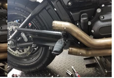
Fig. 1.8 remove lower muffler