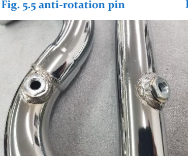
Fig. 5.9 install sensors adapters