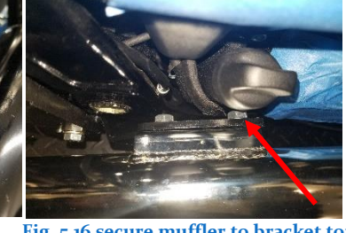
Fig. 5.16 secure muffler to bracket top view

Fig. 5.15 secure muffler to bracket rear view