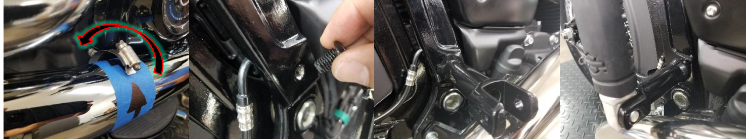
Fig. 5.21 arrow shows direction of insertion

Fig. 5.22 remove plastic plug from Fig. 5.23 install peg bracket thread hole on frame