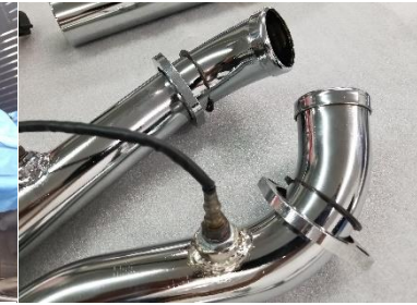
Fig. 5.11 insert barrel band clamps

Fig. 5.7 saddle bag bracket support Fig. 5.8 install rings and flanges