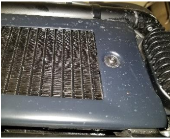
Figure 1.13 remove screw