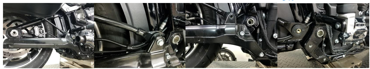
Fig 4.4 remove slip on muffler