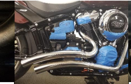
Fig. 5.10 install Oxygen sensors