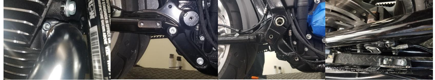
Fig. 2.11 remove mounting bracket Fig. 2.12 mounting bracket removed Fig. 3.1 remove upper muffler screws Fig. 2.10 remove front flange nuts