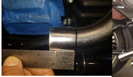
Fig. 5.13 mark line at 1-3/8" or 35mm from edge both pipes