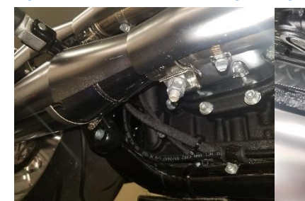
Fig.2.1 loosen lower clamp

Fig. 1.19 remove mounting bracket Fig. 2.1 loosen upper clamp