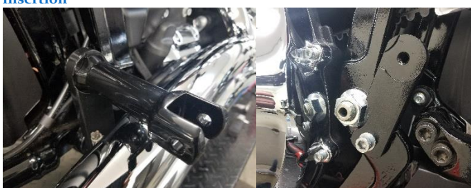
Fig. 5.25 wide tire bracket installation on right side

Fig. 5.26 wide tire bracket installation on left side