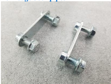
Fig. 5.17 direction of insertion

Fig. 5.13 mark line at 1-3/8" or 35mm from edge both pipes