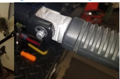
Fig. 1.16 remove retaining ring