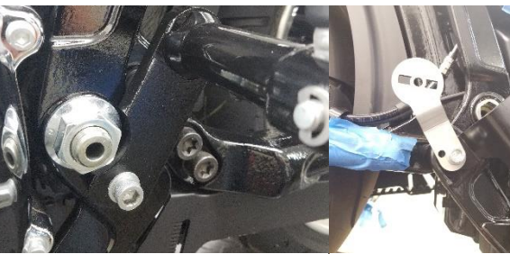
Fig. 5.6 left side peg relocator

Fig. 5.7 saddle bag bracket support Fig. 5.8 install rings and flanges