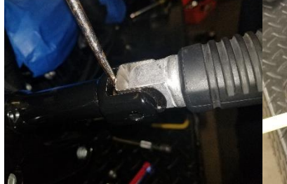
Fig. 1.17 pull pin and remove peg