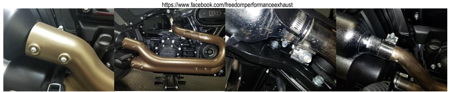
Fig. 1.1 remove screws