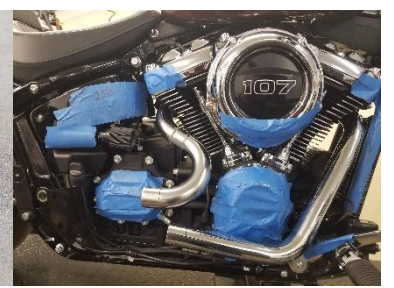
Fig. 5.12 install front and rear pipe