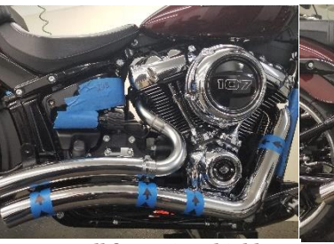
Fig. 5.18 Mark heat shields as shown Fig. 5.19 Install front pipe shield Fig. 5.20 Install rear pipe shield

Fig. 5.16 secure muffler to bracket top view