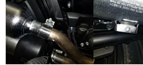
Fig 1.5 loosen muffler clamps