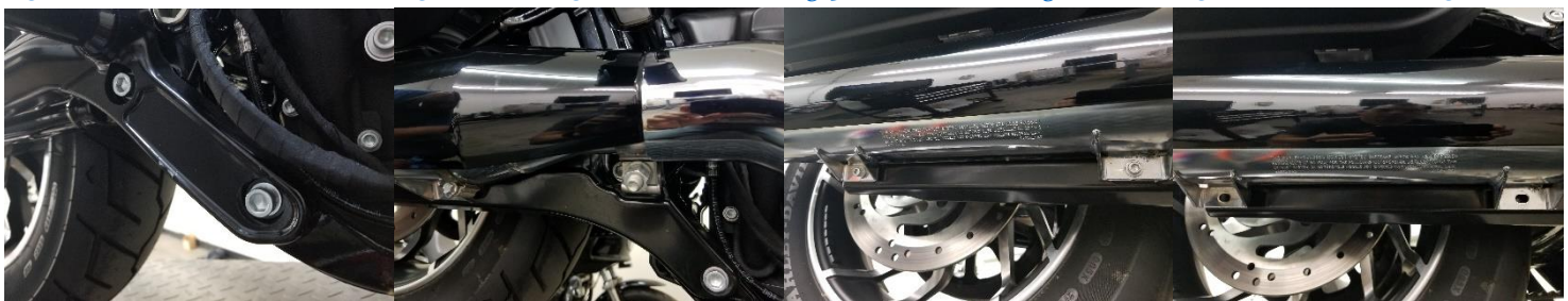
Fig. 3.10 remove mounting bracket Fig. 4.1 loosen clamp