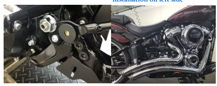
Fig. 5.29 saddle bag relocator bracket

Note: use good and safe practices when removing and installing your new exhaust system to prevent injuries that includes but is not limited to such safety glasses and gloves. When installing make sure gloves are not abrasive or damage may occur like scratching parts. Always secure motorcycle before any work is done.