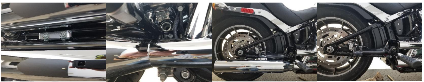
Fig. 3.2 remove lower muffler screws Fig. 3.3 loosen both muffler clamps Fig. 3.4 remove upper muffler

Fig. 2.11 remove mounting bracket Fig. 2.12 mounting bracket removed Fig. 3.1 remove upper muffler screws Fig. 2.10 remove front flange nuts