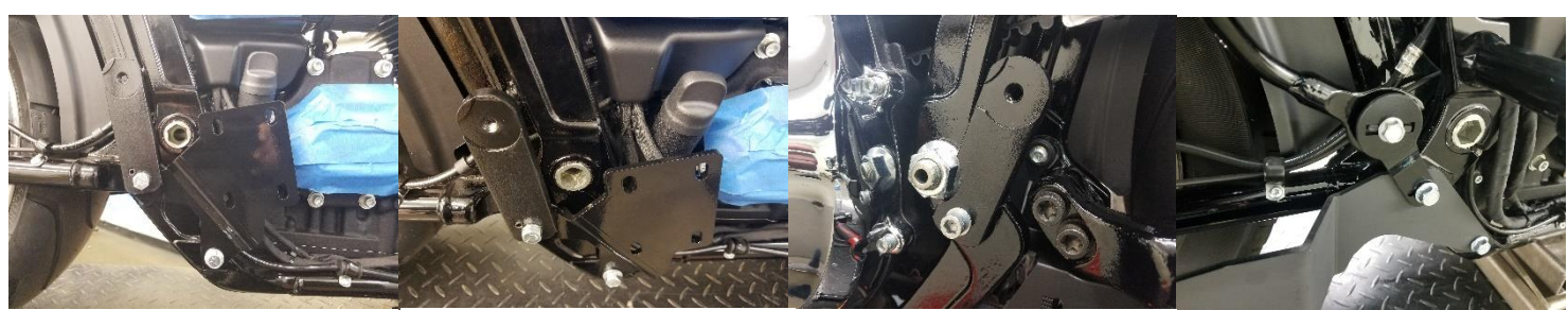
Fig. 5.9 peg adapter right side