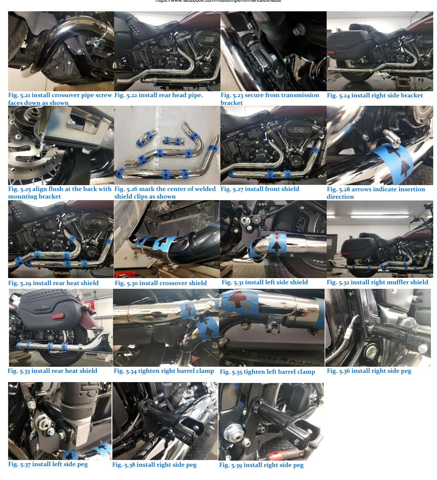
Note: use good and safe practices when removing and installing your new exhaust system to prevent injuries that includes but is not limited to such safety glasses and gloves. When installing make sure gloves are not abrasive or damage may occur like scratching parts. Always secure motorcycle before any work is done.