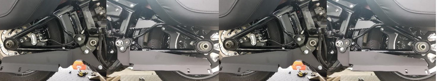
Fig. 5.5 right side bracket