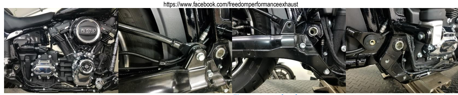
Fig. 4.5 remove system