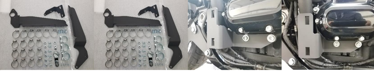
Fig. 5.1 hardware narrow frame