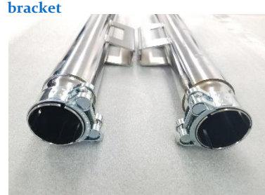
Fig. 5.17 install barrel clamps.