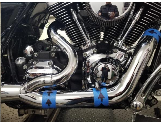
Figure 2.14 Install front heat shield.