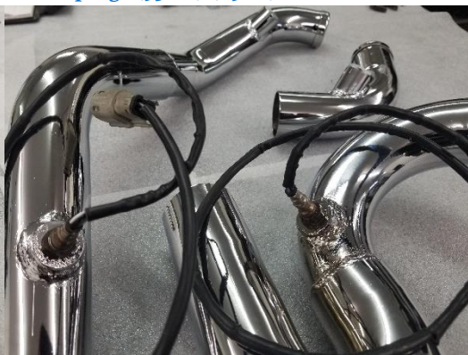
Figure 2.6 Install O2 sensors (09-17).