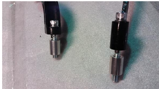
Figure 2.19 spacers shown for (09-16) models.