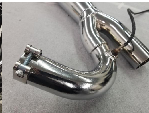
Figure 2.8 Insert barrel clamp as shown