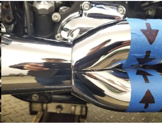
Figure 2.17 make sure shields are flush.