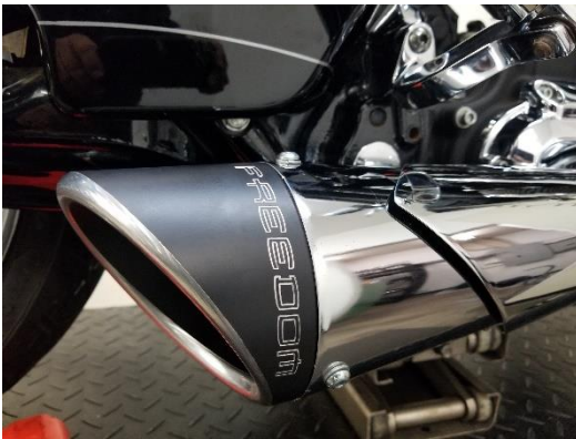
Figure 2.19 note muffler shield rotation.