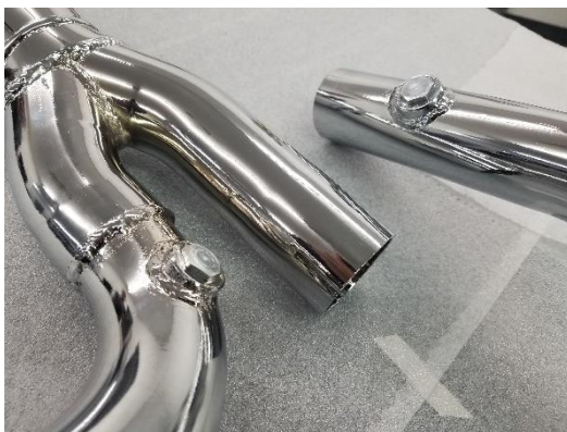
Figure 2.4 Install O2 plugs (07-08).