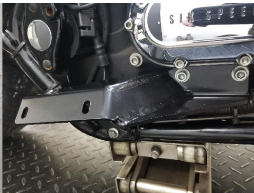
Figure 2.2 Install mounting bracket as shown.