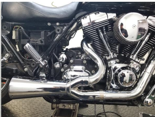
Figure 2.11 Install muffler/pipe assembly.