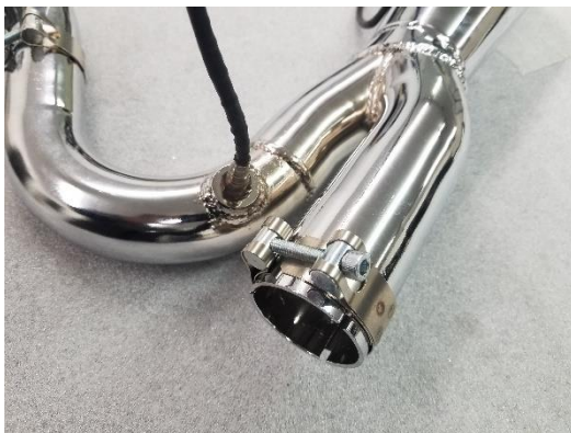
Figure 2.10 insert barrel clamp as shown