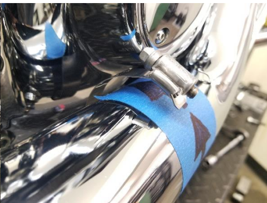
Figure 2.15 insertion of clamp arrow indicates direction of insertion.