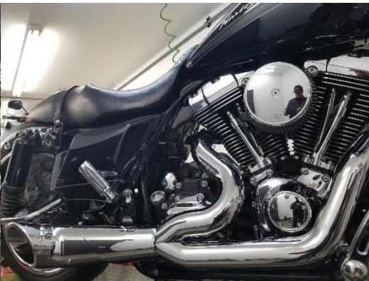
Figure 2.21 shown with turn-out tip