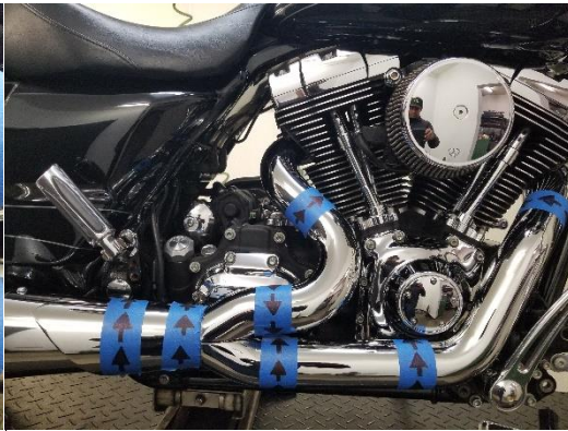
Figure 2.18 Install collector shield.