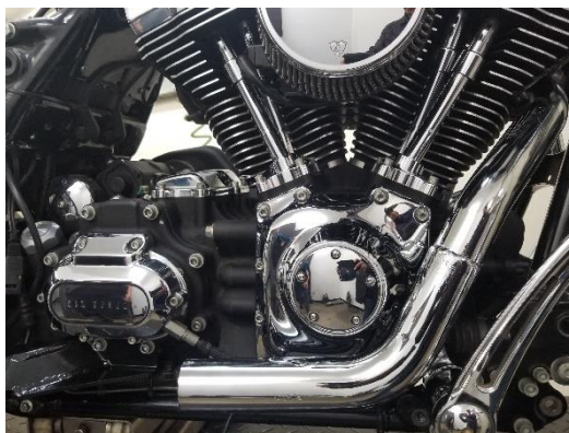
Figure 2.7 Install front header pipe.