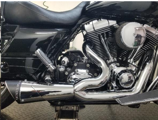
Figure 2.20 system installed.