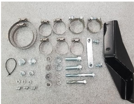
Figure 2.1 Hardware and brackets.