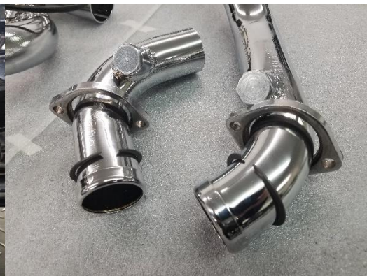
Figure 2.3 Install retaining rings & flanges/ install plugs (95-06) (09-16)