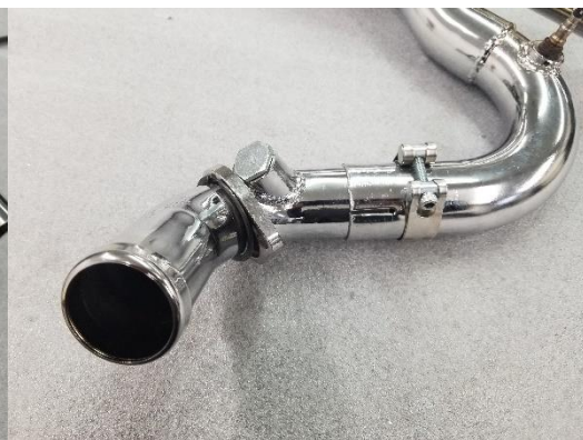
Figure 2.9 insert rear pipe in curved pipe on muffler/pipe assembly.