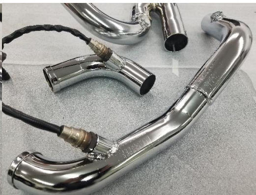
Figure 2.5 Install O2 sensors (07-09).