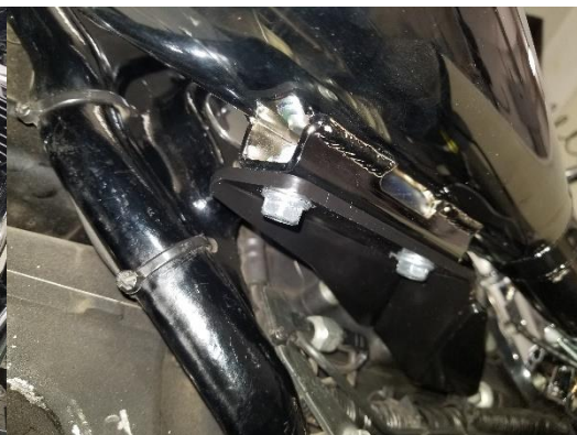
Figure 2.12 attach bracket to mounting bracket flush or a (+/-) 1/8"

Note: use good and safe practices when removing and installing your new exhaust system to prevent injuries that includes but is not limited to such safety glasses and gloves. When installing make sure gloves are not abrasive or damage may occur like scratching parts. Always secure motorcycle before any work is done.