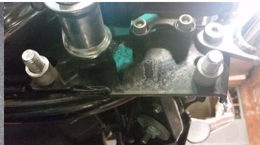
Figure 2.19 spacers shown for (95-06) models.

Note: use good and safe practices when removing and installing your new exhaust system to prevent injuries that includes but is not limited to such safety glasses and gloves. When installing make sure gloves are not abrasive or damage may occur like scratching parts. Always secure motorcycle before any work is done.