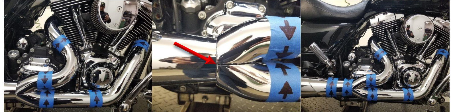
Figure 2.16 Install rear shield.