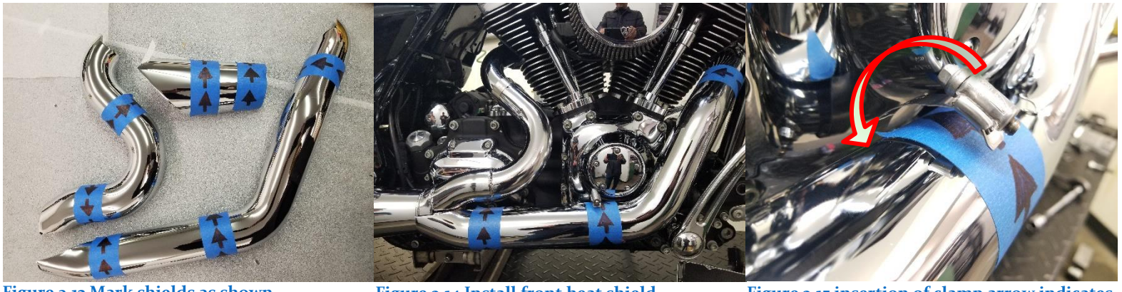
Figure 2.13 Mark shields as shown.