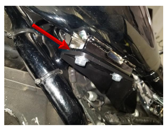
Figure 2.12 attach bracket to mounting bracket flush or a (+/-) 1/8"