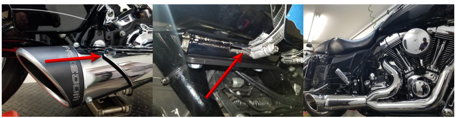
Figure 2.19 note muffler shield rotation.