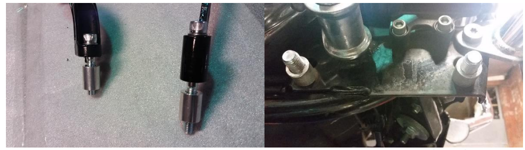
Figure 2.19 spacers shown for (09-16) models. Figure 2.19 spacers shown for (95-06) models.