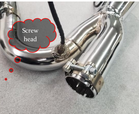
Figure 2.10 insert barrel clamp as shown