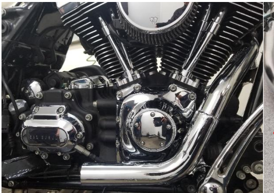
Figure 2.7 Install front header pipe.