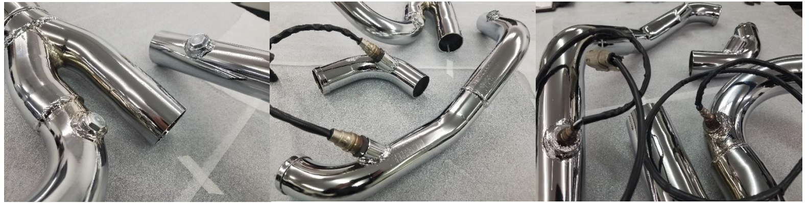
Figure 2.4 Install O2 plugs (07-08).