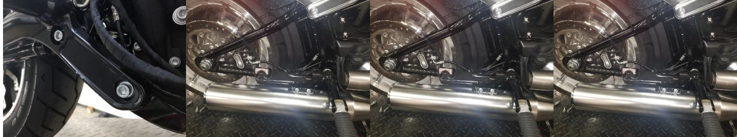
Fig. 3.10 remove mounting bracket Fig. 4.1