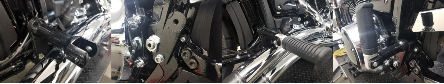
Fig. 5.25 wide tire bracket installation on right side