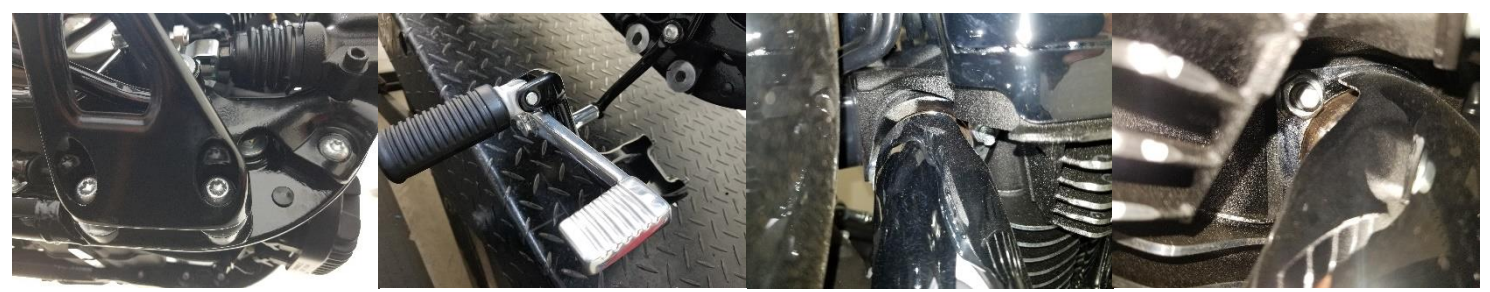
Fig. 3.6 remove mid control screws