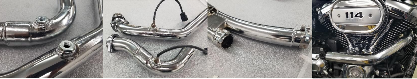
Fig. 5.9 install sensors adapters