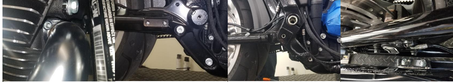
Fig. 2.10 remove front flange nuts