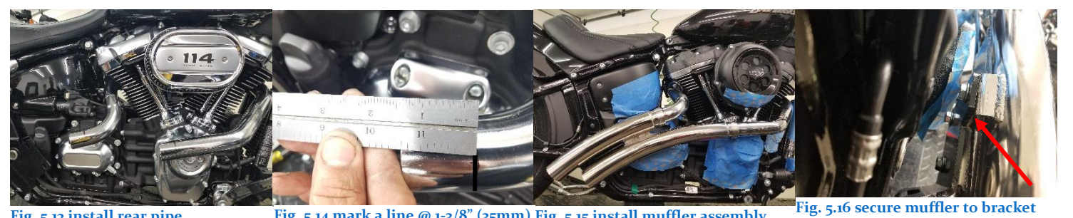
Fig. 5.13 install rear pipe