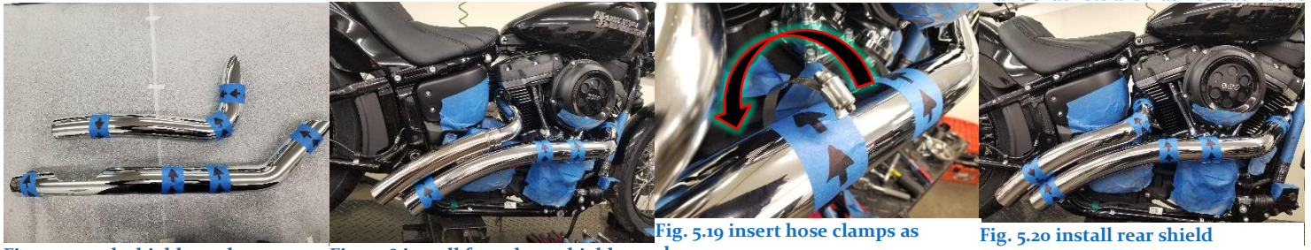
Fig. 5.17 mark shields as shown