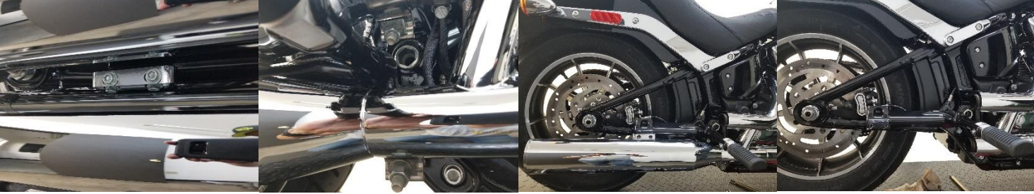
Fig. 3.2 remove lower muffler screws Fig. 3.3 loosen both muffler clamps Fig. 3.4 remove upper muffler