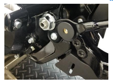
Fig. 5.29 saddle bag relocator bracket