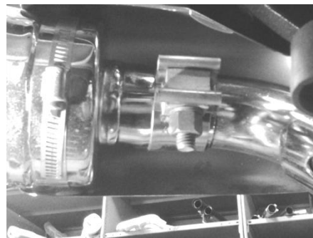
Figure 1.2 remove hose clamp and loosen muffler clamp