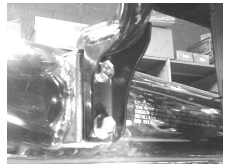
Figure 1.3 remove bolts (x4)