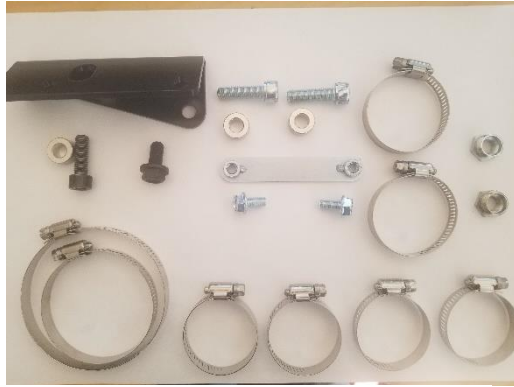
Fig 2.2 Shorty