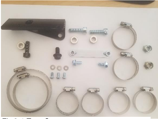
Fig 2.1 Turn-Out