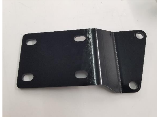
Fig 2.2 Bracket