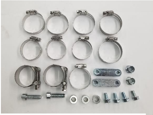
Fig 2.1 Hardware