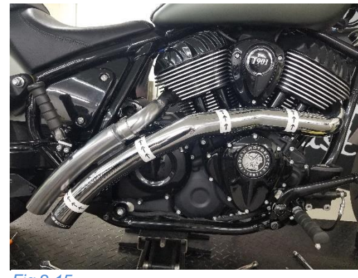
Fig 2.14 Fig 2.15