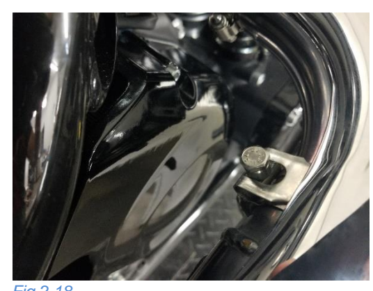
Fig 2.16 Fig 2.17 Fig 2.18