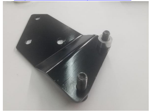
Fig 2.2 Bracket