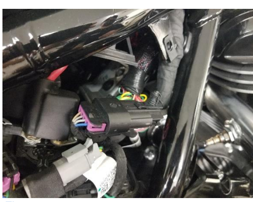
Fig 2.19 Fig 2.20 Fig 2.21