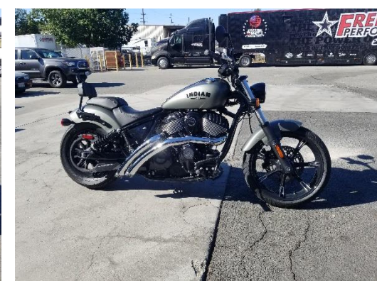
Fig 2.22 Fig 2.23 Fig 2.24