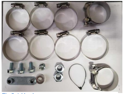
Fig 2.1 Hardware