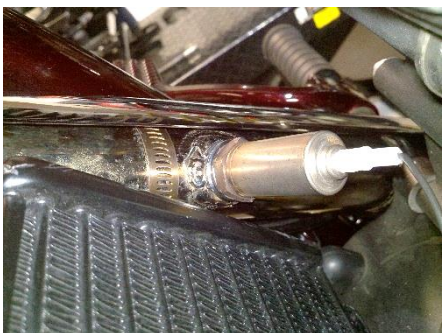
Fig 2.7 install sensor and connect to harness

Note: use good and safe practices when removing and installing your new exhaust system to prevent injuries that includes but is not limited to such safety glasses and gloves. When installing make sure gloves are not abrasive or damage may occur like scratching parts. Always secure motorcycle before any work is done.