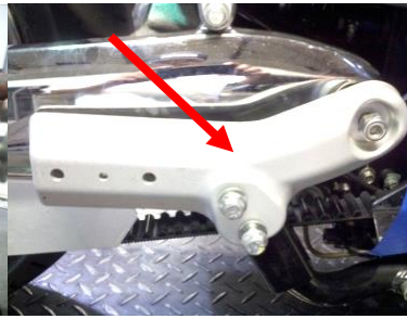
Fig 1.3 remove mounting bracket