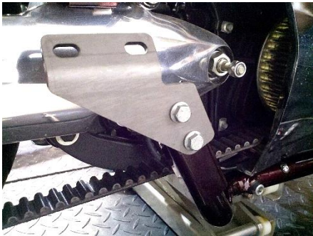
Fig 1.1 install mounting bracket (narrow frame shown)