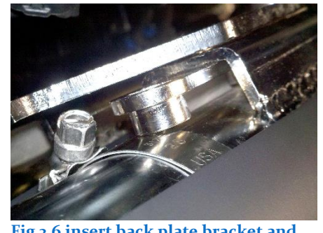
Fig 2.6 insert back plate bracket and secure it with two 5/16\"-18 flange screws flat side seats against bracket