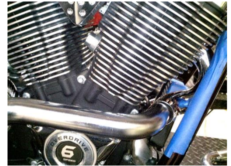
Fig 2.3 install front pipe with shield