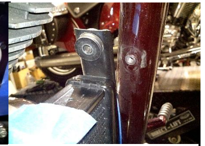
Fig 1.4 remove mounting bracket screws