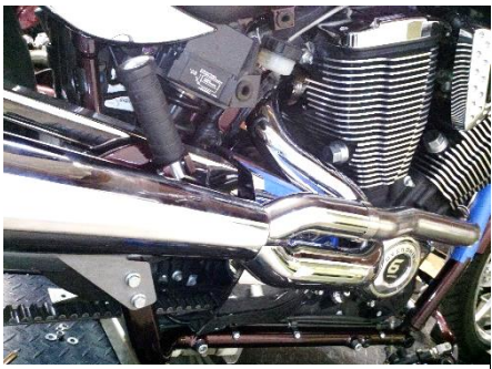
Fig 2.4 install muffler/header assembly