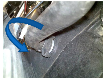
Fig 2.5 rotate hose if necessary away from rear header