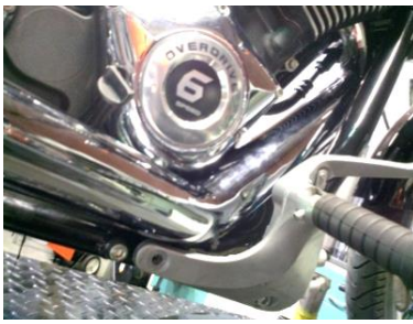
Fig 1.1 remove peg assembly