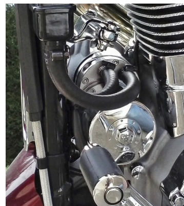
This mounting orientation may be required on some Sportster models