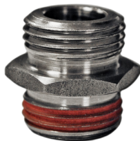
Stock-to-Jagg oil filter nipple

Install by inserting the orange-painted end into the port where the stock oil filter stem was removed. Using a 7/8" socket, tighten until the hex is flush against the oil filter housing.