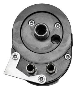
T-C Softail fitment