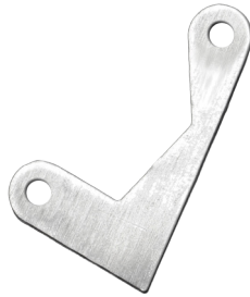
4600AR-C Jagg anti-rotation device