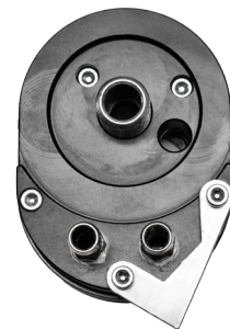
T-C Touring & Dyna fitment