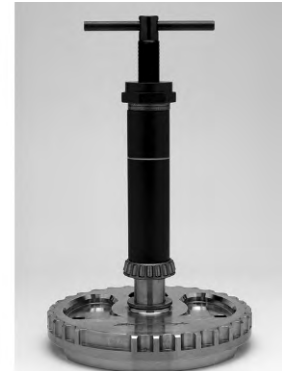
TIMKEN FIGURE 3