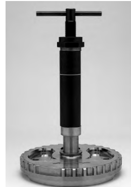
RACE FIGURE 2