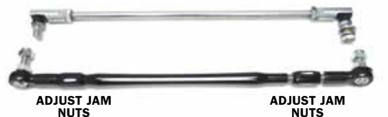
ADJUST JAM NUTS