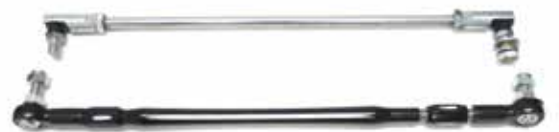
ADJUST JAM NUTS