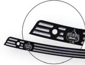
KW LOGO (KERF)