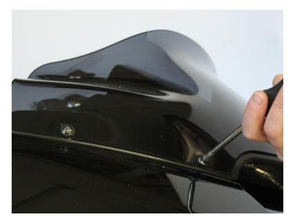
1. Loosen, but do not remove, the four windshield mounting screws and gently remove your windshield