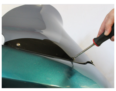
1. Remove all five windshield fasteners and remove your windshield

Reinstallation of the stock weather stripping is not required