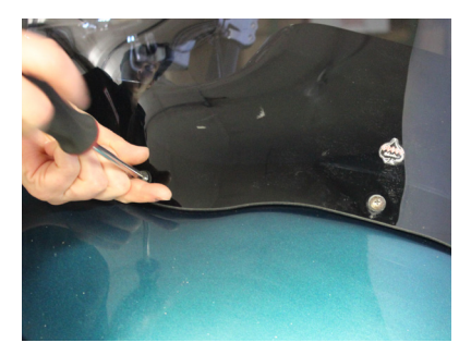
3. Starting with the center screw, install your new Flare™ Windshield and torque to factory specifications.

Klock Werks cannot be held responsible for any damage resulting from improper installation performed by any consumer or their dealer.