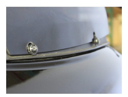
3. Install your new Flare™ Windshield onto the mounting screws and torque to factory specifications