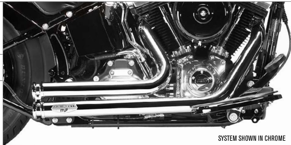
SYSTEM SHOWN IN CHROME