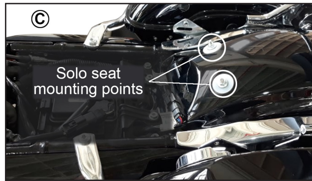
INSTALLING A PASSENGER PILLION (optional)

Saddlemen passenger pillion seats will have two slotted brackets at the front of the pillion, that will slide into the two rear flange nuts of the front solo seat. With those two brackets in place, the rear single mounting tab can be installed into the original seat mounting point in the rear fender.