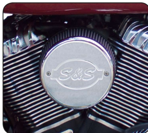
170-0242 S&S® Cycle Logo