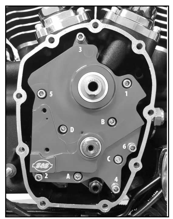
Picture 3: Cam Support Plate Screws (1-6) and Oil Pump Screws (A, B, C, D)