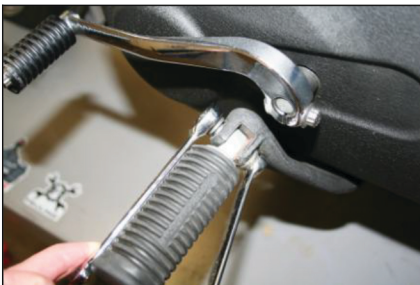
REMOVE EXISTING PEGS